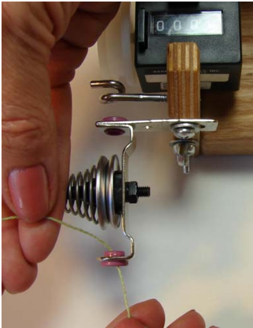
Figure 1 – Insert tip at first hole